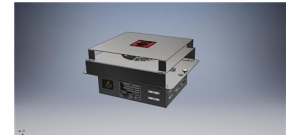
Sahara Fan Model SF309

Dimensions Width - 1158mm Depth - 680mm Height - 900mm Weight - 67kg