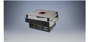
Sahara Fan Model SF309