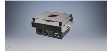
Sahara Fan Model SF309

Width - 1486mm Depth - 680mm Height - 900mm Weight - 101kg